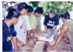
Fifty community members receive training in production of Cordillera Azul Park signage at Chazuta, Peru in March, 2002.