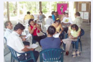
Educators from communities near Peru's Cordillera Azul National Park participate in an environmental education workshop held at Tarapoto, Peru in October, 2004.