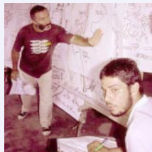
More than 50 community members are trained in Cordillera Azul Park sign production techniques at a three-day workshop at Shamboyacu, Peru in February, 2002.