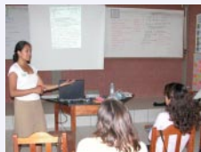
Communication and environmental education workshops at The Amazonian University of the Pando, Cobija, Bolivia, July, 2004