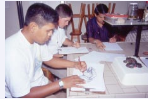
A scientific illustration class at the Amazonian University of the Pando, in Cobija, Bolivia, draws from the collection in July, 2002.

Training in collections management, specimen preparation, and use of museum collections for public education at the Natural History Museum "Pedro Villalobos," at the Amazonian University of the Pando, Cobija, Bolivia