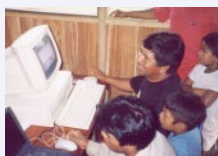
Cofan community members are trained in using spreadsheets to record data from community research projects in Zabalo, Ecuador in June, 2003.